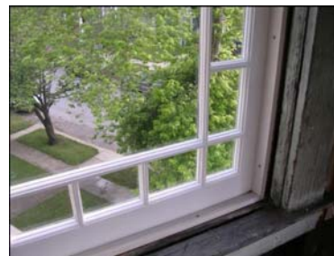
The same window before and after restoration