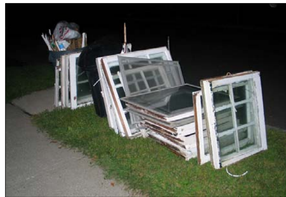
Windows on the curb awaiting trash pick up [Kim Konrad Alvarez]

Structures built prior to 1930 incorporated architectural elements, including windows that celebrated a particular style and craft in a variety of wood species, shapes, cuts and