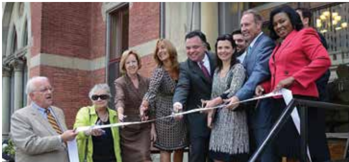
Project partners celebrate the rehabilitation of the Rochester Free Academy for commercial and residential use. The multi-million dollar project, which utilized preservation tax credits, has returned one of downtown Rochester's architectural gems to active use and promises to stimulate further local redevelopment efforts.

New Yorkers are proud of their rich heritage and value the diverse range of properties that make up the historic fabric of this great state. These places are the focus of state and local pride and identity and are valuable assets that contribute to improving and reinvigorating our communities in significant and sustainable ways. This plan has been prepared to help all New Yorkers identify, preserve, enhance and promote the state's historic and cultural properties as well as achieve the social, economic, environmental and cultural benefits