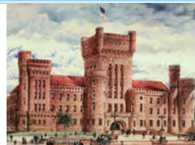
An illustrated history of New York State's armories, New York's Historic Armories, An Illustrated History , was published through a partnership between the state Office of Parks, Recreation and Historic Preservation and the state Division of Military and Naval Affairs.

New York State's historic preservation tax credit program was established, offering owners of commercial properties located in distressed census tracts and qualified for the federal tax credit a state income tax credit equal to 20% of rehabilitation costs. Owner-occupied residential properties that are listed on the State and National Registers of Historic Places and located in distressed census tracts are eligible for a state tax credit equal to 20% of rehabilitation costs. The credit was enhanced in 2009 with the addition of 800 new census tracts.