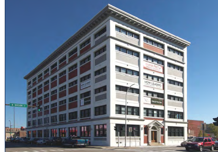
The former warehouse before (left) and after rehabilitation.