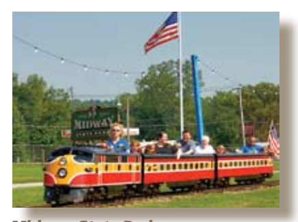
Midway State Park

Lake. The $1 million cost of these projects was funded through the State Parks Capital Initiative.