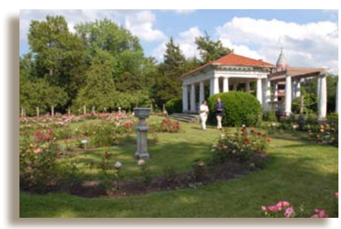
Sonnenberg Gardens & Mansion State Historic Park

veranda and several architectural features in the historic gardens.