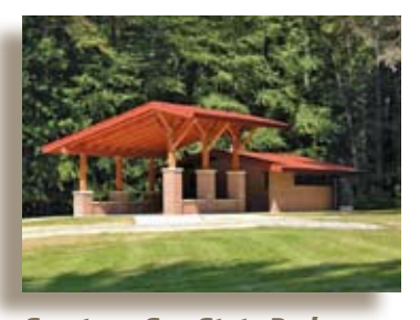
Saratoga Spa State Park

upgraded since their original construction in the 1960s and were in sore need of reinvestment. The agency completed a $1.5 million infrastructure improvement project to