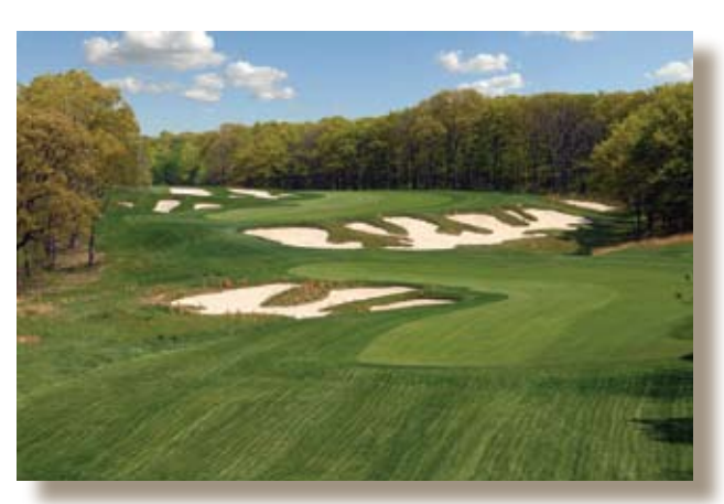
Bethpage State Park - Black Course

Bethpage State Park – United States Open Golf Championship. Bethpage State Park hosted the 2009 United States Open Championship on the Black Course from June 15th to June 21st. Approximately 300,000 golf enthusiasts traveled to Bethpage to view the world's premier golfers. Millions more viewed 30 hours of live television coverage. Jones Beach State Park provided spectator parking. The event generated an estimated $75 million dollar economic impact to the metro-