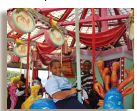
Riverbank State Park

Riverbank State Park. During 2009, OPRHP made major investments to infrastructure re-