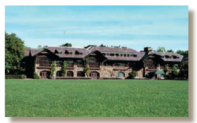
Bear Mountain State Park

Niagara Falls – NorthStar Underground Railroad Interpretive Site. OPRHP is supporting a partnership effort, led by the City of Niagara Falls, to recognize and interpret the City's important role in our nation's Underground Railroad story. The City is developing plans to rehabilitate a portion of a vacant building, adjacent to the Niagara River Gorge, to establish the NorthStar Interpretive Site. Plans are also being made to commemorate Niagara Falls State Park's 125th anniversary in 2010.