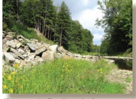
Chenango Valley State Park

severe flooding and erosion over the past several years. With the assistance of the Federal Emergency