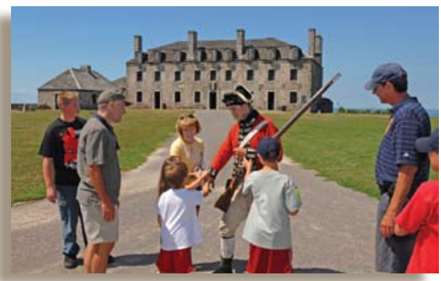
Old Fort Niagara State Historic Site

Fort Niagara State Park / Old Fort Niagara State Historic Site. Old Fort Niagara, which features original structures dating from 1726 to 1871, was an important military fortification due to its strategic location where the