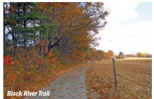
Black River Trail

The region successfully secured an $800,000 Transportation Enhancement Program grant to extend the popular 3.5 mile Black River