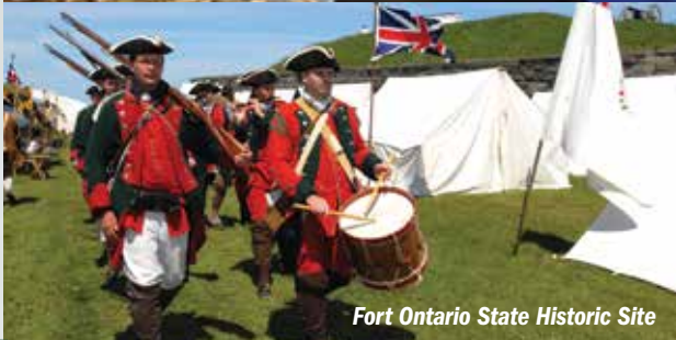
Fort Ontario State Historic Site