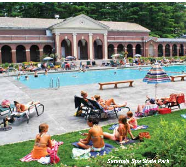
Saratoga Spa State Park

The term "State park system" as used in this report refers to New York's 180 State parks and 35 State historic sites.