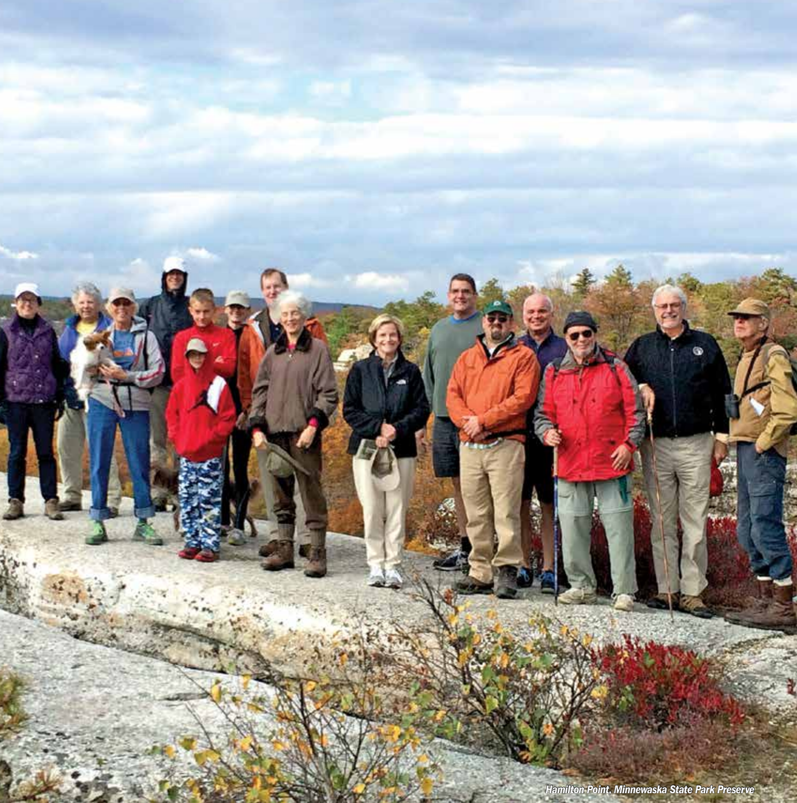
Hamilton Point, Minnewaska State Park Preserve