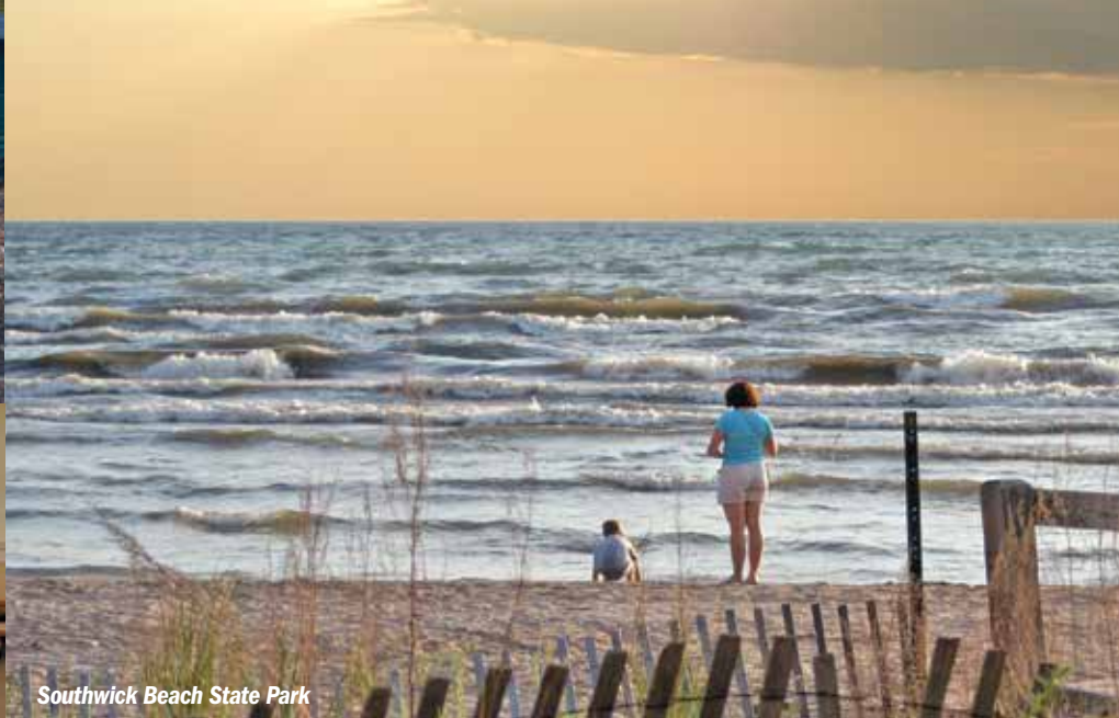
Southwick Beach State Park