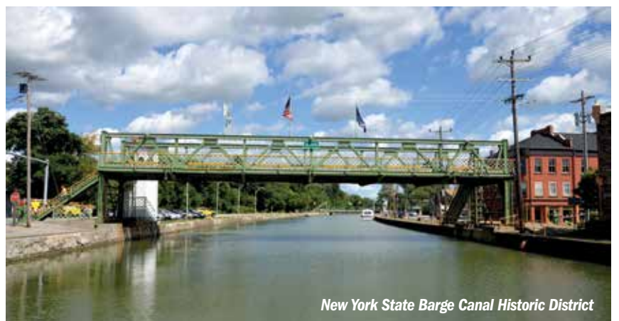
New York State Barge Canal Historic District