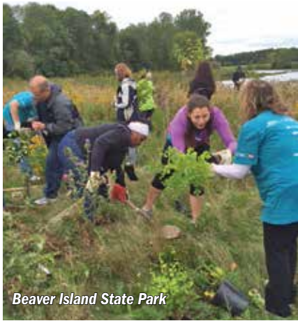
Beaver Island State Park

Friends and partners from the region's corporate sector rolled up their sleeves at Beaver Island State Park to help plant trees, paint shelters, clean the beach, remove invasive species. HSBC included this day of service as part of an annual conference that was meeting in Buffalo. Over 150 volunteers from HSBC not only contributed sweat equity, they brought a check for $1500 to cover the cost of the trees they planted.