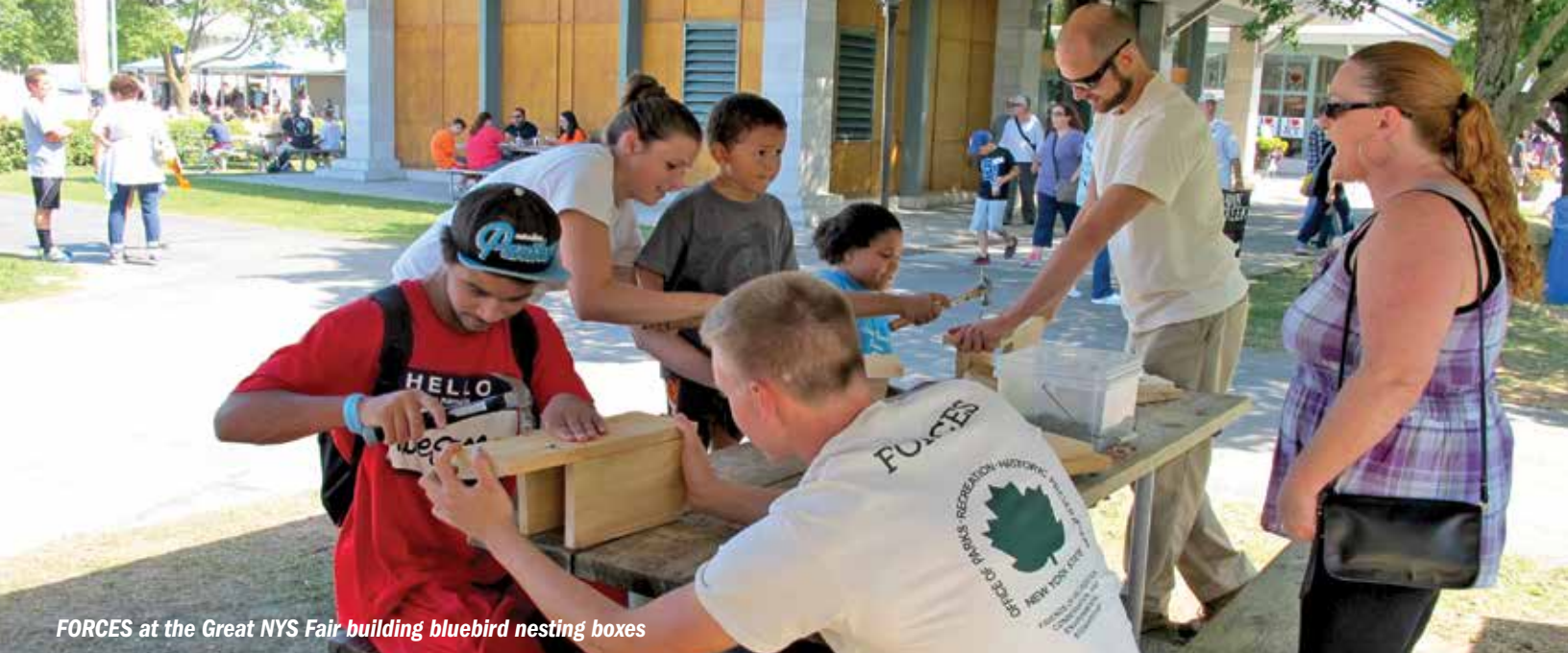
FORCES at the Great NYS Fair building bluebird nesting boxes