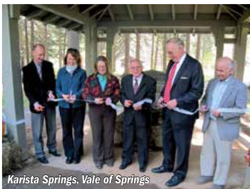
Karista Springs, Vale of Springs

The Friends of Saratoga Spa State Park, together with the regional commission, also raised the funds to rehabilitate and reopen the Karista Spring in the historic Vale of Springs area, with donations from the Adirondack Trust Company and Allerdice Building Supply.