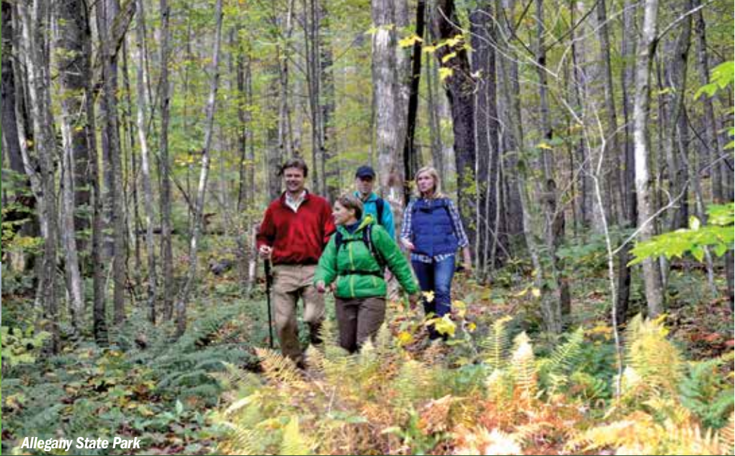
Allegany State Park