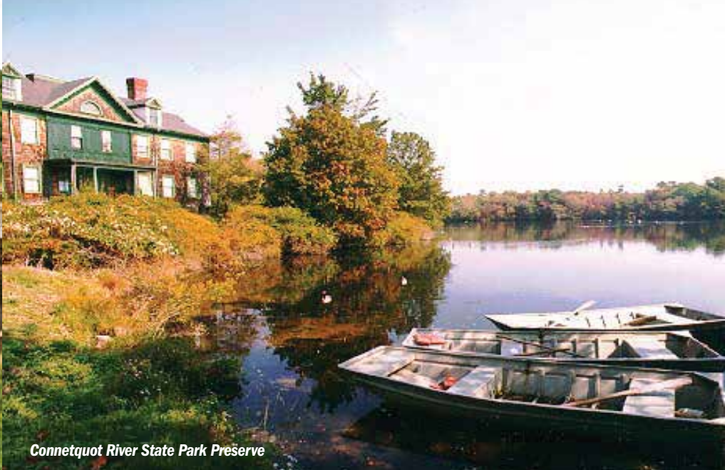
Connetquot River State Park Preserve