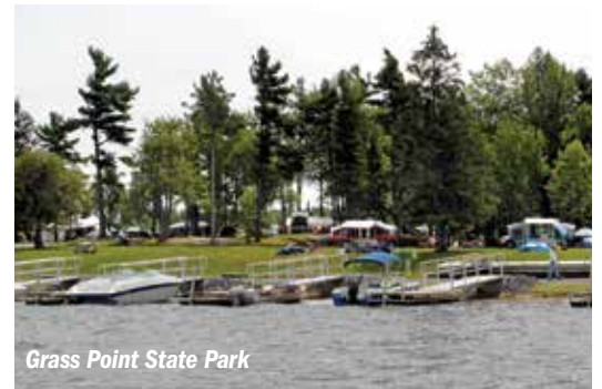
Grass Point State Park

At Grass Point State Park campers in 2015 will enjoy the new Beach Bathhouse currently under construction. The outdated and