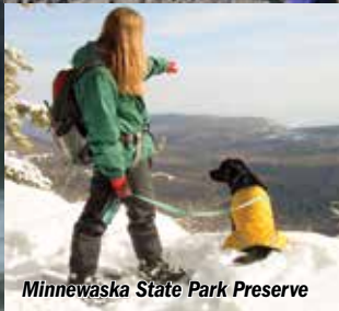
Minnewaska State Park Preserve