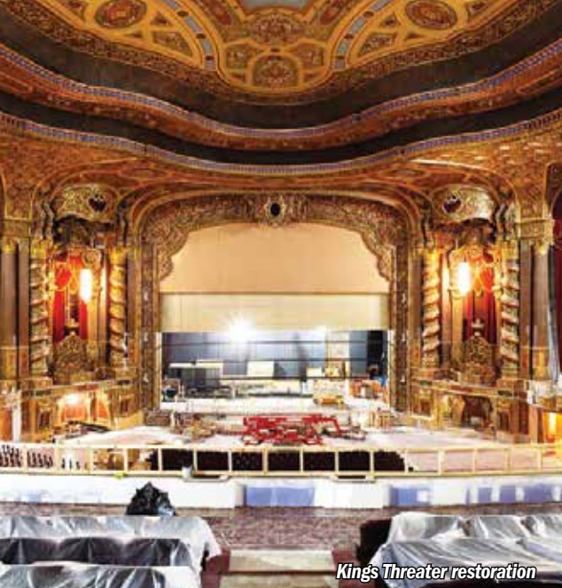
Kings Theater restoration