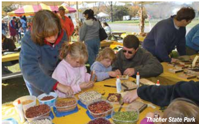
Thacher State Park

One of the most iconic state parks in New York's Capital Region, Thacher State Park celebrated its 100th anniversary in 2014. The occasion was with a day of celebration on September 14, 2014 which included the dedication of a new historic marker and interpretive sign that explain the park's rich geologic and cultural history.