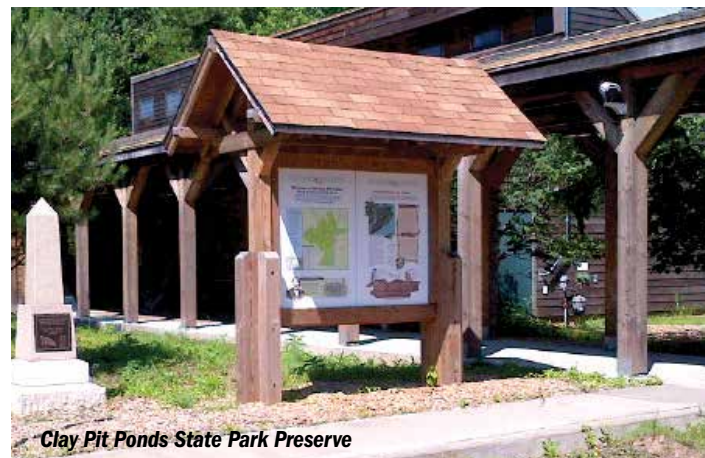
Clay Pit Ponds State Park Preserve

marsh. At 260 acres, Clay Pit Ponds State Park Preserve is the largest state park in New York City, featuring miles of walking and riding trails and surprisingly undisturbed nature. Interpretive signage and information kiosks have been installed this year at key points in the park's trail system near the scenic ponds. The park's Interpretive Center hosted dozens of visits from area school children, offering programs ranging from nature scavenger hunts and hikes to readings about life on the park's historic Gericke Farm. The regional commission is evaluating use of Gericke Farm, NYC's oldest continuously operated organic farm and an unsung asset of Clay Pit Ponds Preserve.