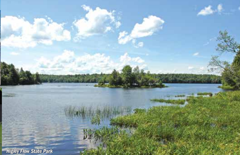
Higley Flow State Park