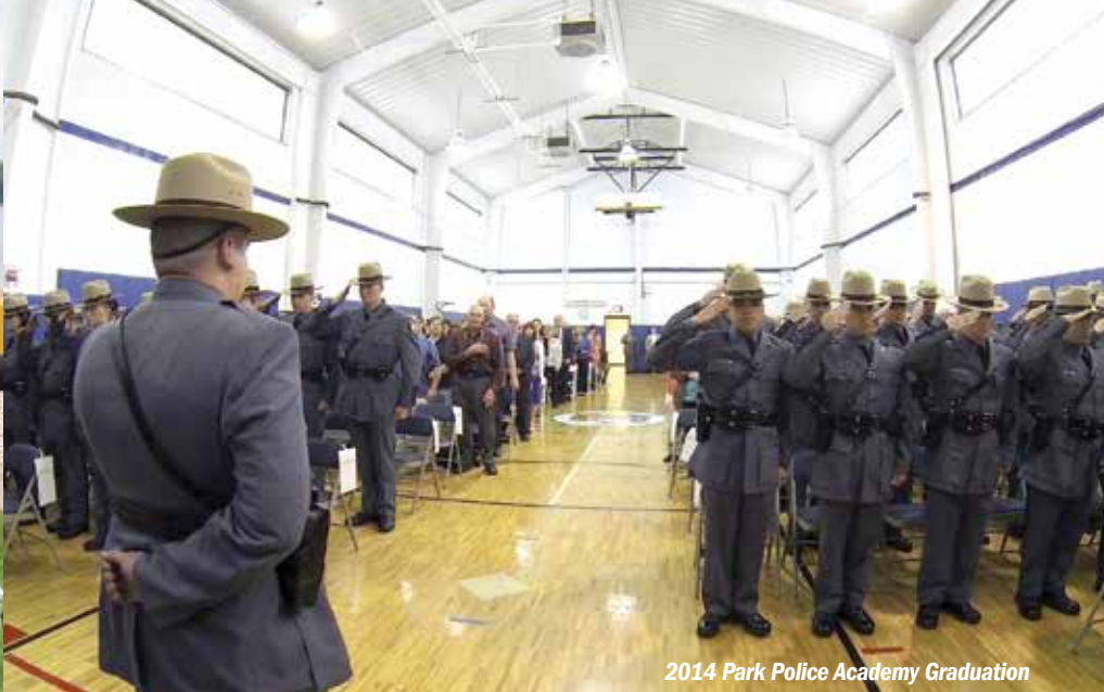
2014 Park Police Academy Graduation