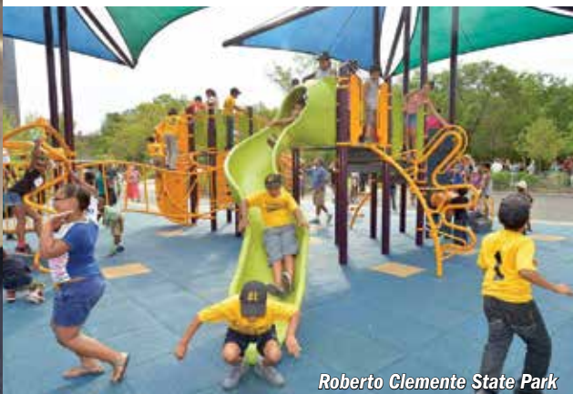
Roberto Clemente State Park

With continued capital investment, the Agency will further its efforts to fix aging infrastructure, and convert and transform New York’s parks and historic sites into a welcoming, transformative, 21st century park system with the following priorities: continue to address the backlog of capital needs in existing facilities, infrastructure and health and safety; incorporate energy efficiency, green technology and automation in capital projects; protect our Natural Resources; build for future storm readiness; and continue to develop public-private partnerships for signature projects.