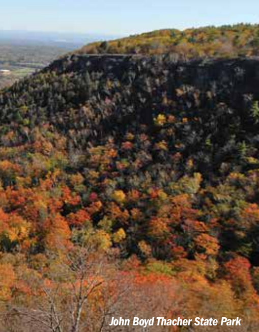
John Boyd Thacher State Park