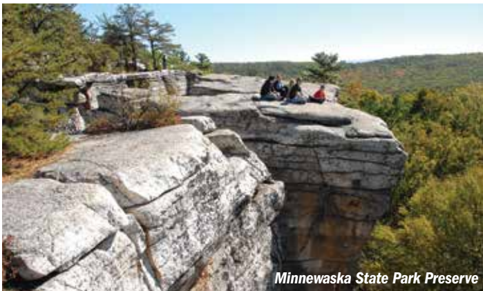
Minnewaska State Park Preserve

The Open Space Institute added 1,068 acres to Minnewaska State Park Preserve through the transfer of the Sam's