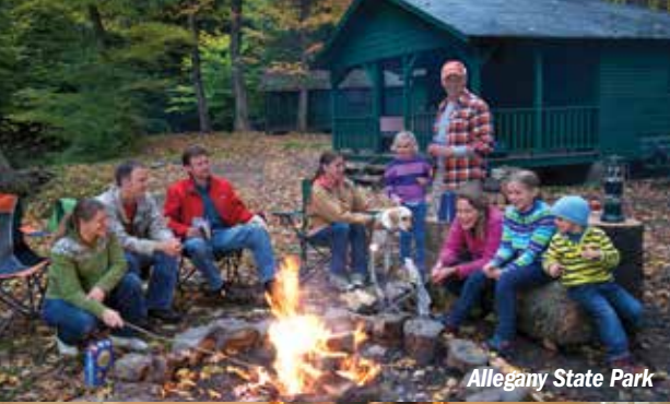
Allegany State Park