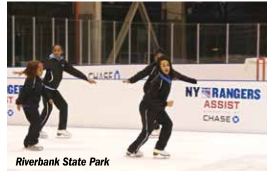
Riverbank State Park

Hundreds of youth participate in youth ice hockey and figure skating programs at Riverbank State Park . The park's ice rink was renovated with NY Works funds and now features a new concrete slab, new boards and stylish wind and sun shields on the