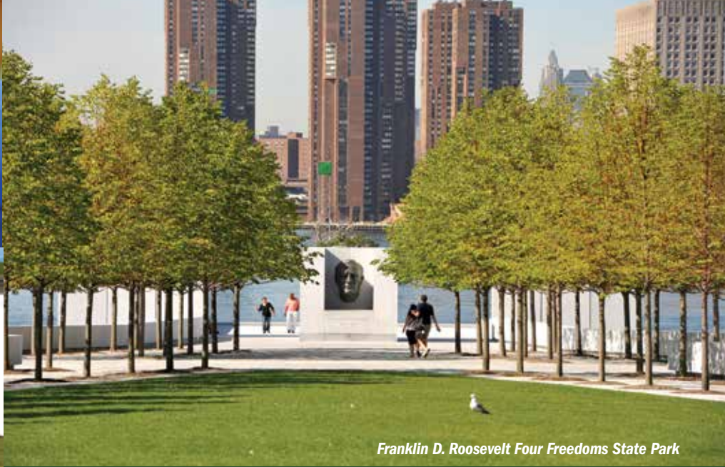
Franklin D. Roosevelt Four Freedoms State Park