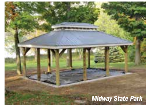
Midway State Park

and a desire from the public for more event space in the park. The new pavilions are barrier free, allowing full accessibility to all.