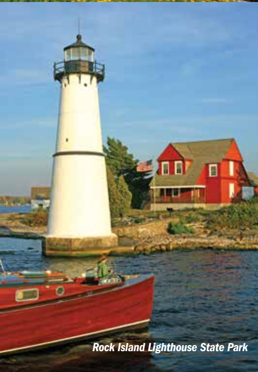
Rock Island Lighthouse State Park