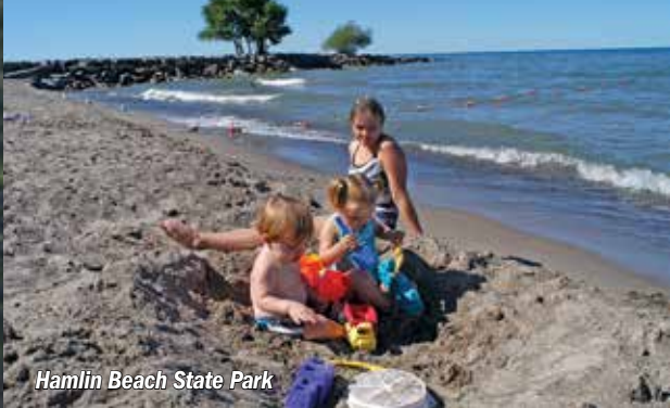
Hamlin Beach State Park