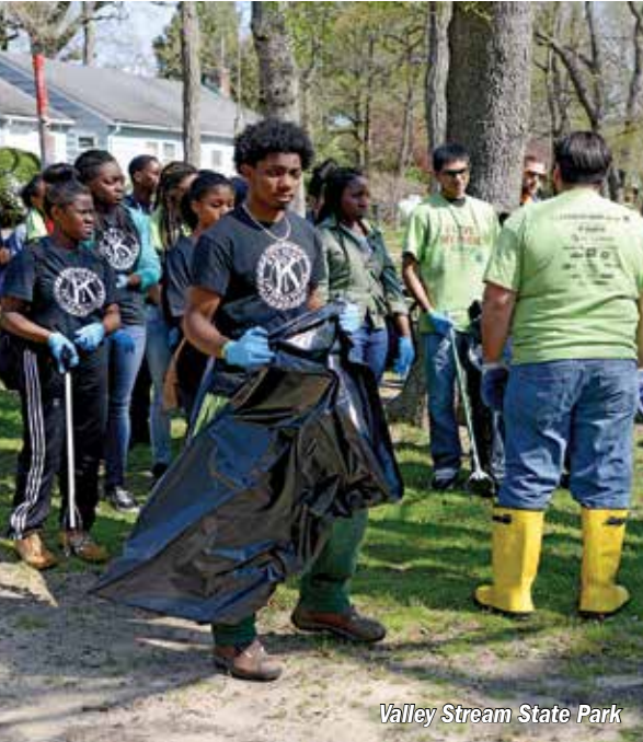
Valley Stream State Park