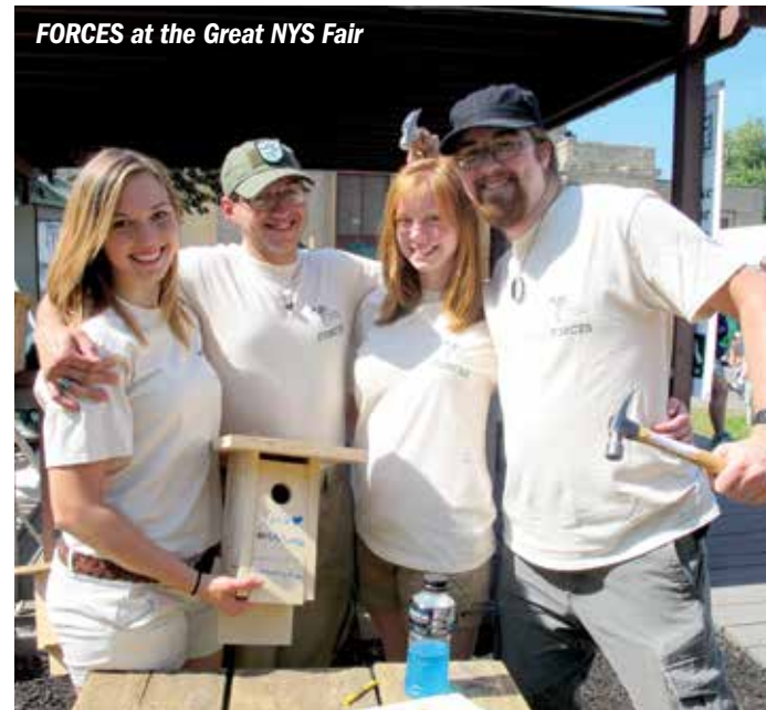
FORCES at the Great NYS Fair

In addition to the current FORCES expansion in Central & Finger Lakes, State Parks staff along with students and faculty at partnering institutions, are either exploring or implementing FORCES initiatives in Niagara, Genesee, Saratoga and Taconic Regions.