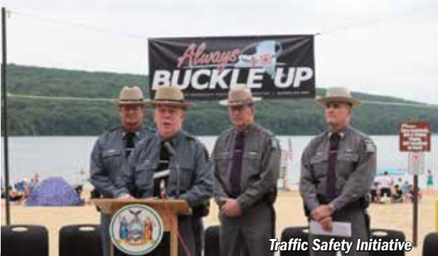
Traffic Safety Initiative