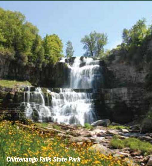
Chittenango Falls State Park