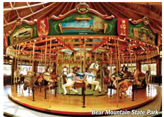
Bear Mountain State Park

Visitors to Bear Mountain State Park have enjoyed the historic Carousel for many generations. In 2014, an anonymous donor made a $150,000 gift to assist in the Carousel's operations and replace the roof.