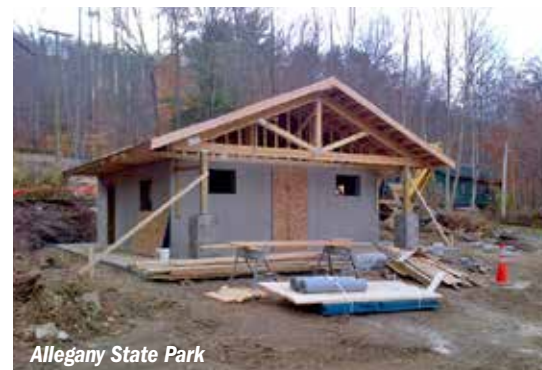
Allegany State Park

The region made significant progress on major capital revitalization projects in 2014. Through a nearly $3 million investment from NY Works, improved shower buildings are under construction at Ryan and McIntosh Trails and at Cain Hollow, three deteriorated buildings will be completely replaced. These improvements will greatly benefit the over 200,000 people who camp at Allegany State Park