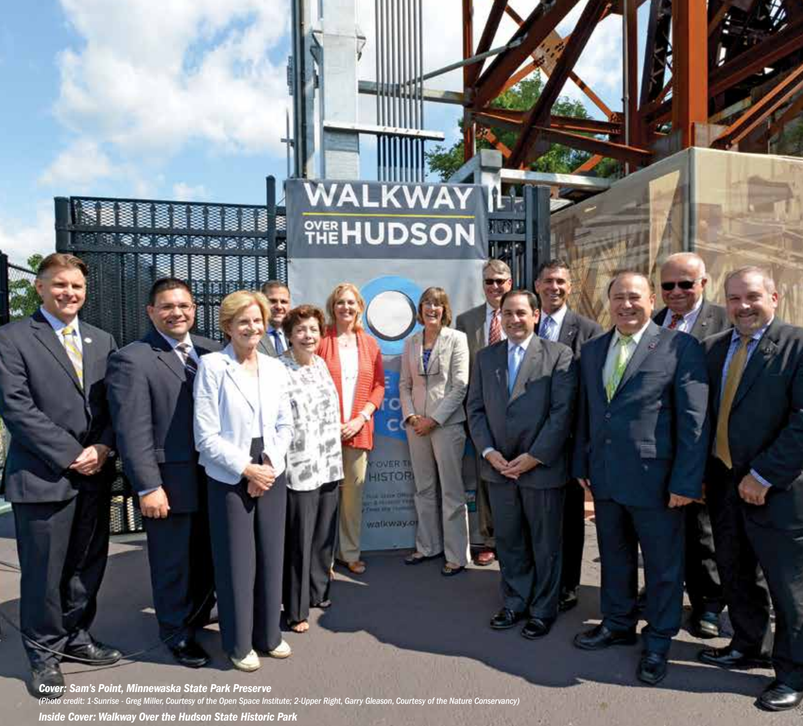
Cover: Sam's Point, Minnewaska State Park Preserve