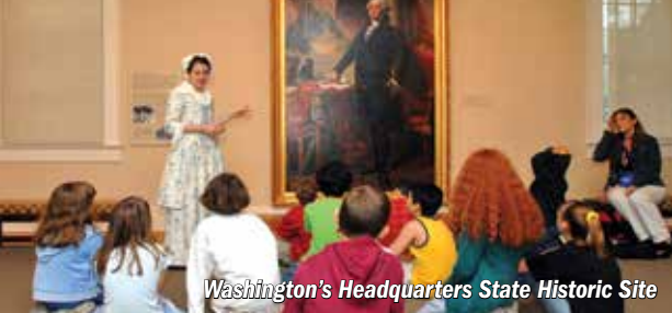
Washington's Headquarters State Historic Site