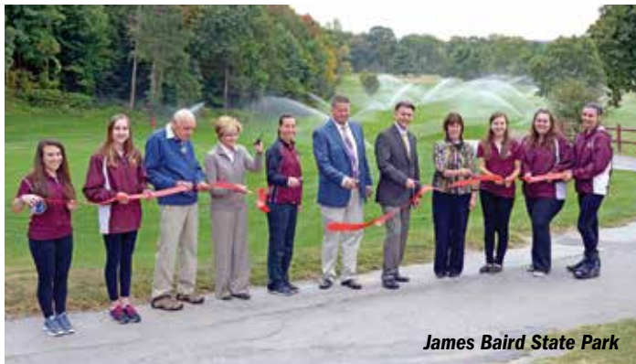
James Baird State Park

creating a new lookout area over the Ore Pit Pond swimming area and improved pedestrian accessibility to the pond with a fence along the road and a newly refurbished sidewalk. Through a collaboration between State Parks and NYS DOT, Franklin Delano Roosevelt State Park now has an improved and environmentally-friendly parking lot for visitors to the largest pool in the State Parks' system. The $1.9 million project brought bioswales, grassy islands and newly-planted trees, which help to filter out pollutants from storm water and provide shade