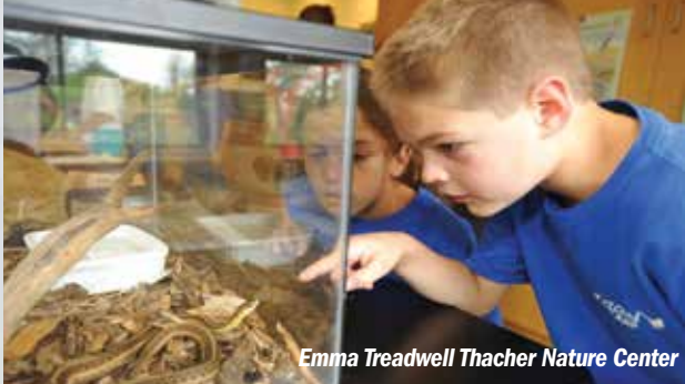
Emma Treadwell Thacher Nature Center