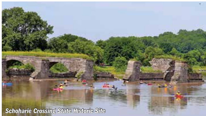
Schoharie Crossing State Historic Site

A grant from the American Battlefield Protection Program of the National Park Service will help history come alive for visitors to Bennington Battlefield State Historic Site by improving interpretation of the site's battle features and increasing programming. In August, over 1300 visitors attended a series of events re-enacting a key battle of the American Revolutionary War that took place in Walloom-sac NY in August 1777. Known as the Battle for Bennington, it was a decisive victory for the American militia in the run up to the turning point of the Revolution at Saratoga. Dedicated volunteers from numerous veterans and re-enactment groups hosted the event.