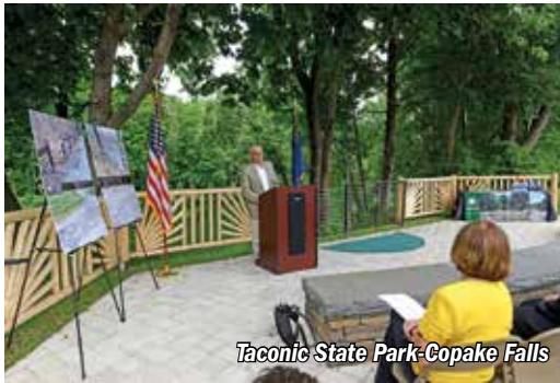
Taconic State Park-Copake Falls

Several NY Works projects improved park facilities throughout the region. A new $1.1 million entrance area has greatly improved Taconic State Park's Copake Falls Area . An environmentally-friendly parking lot features