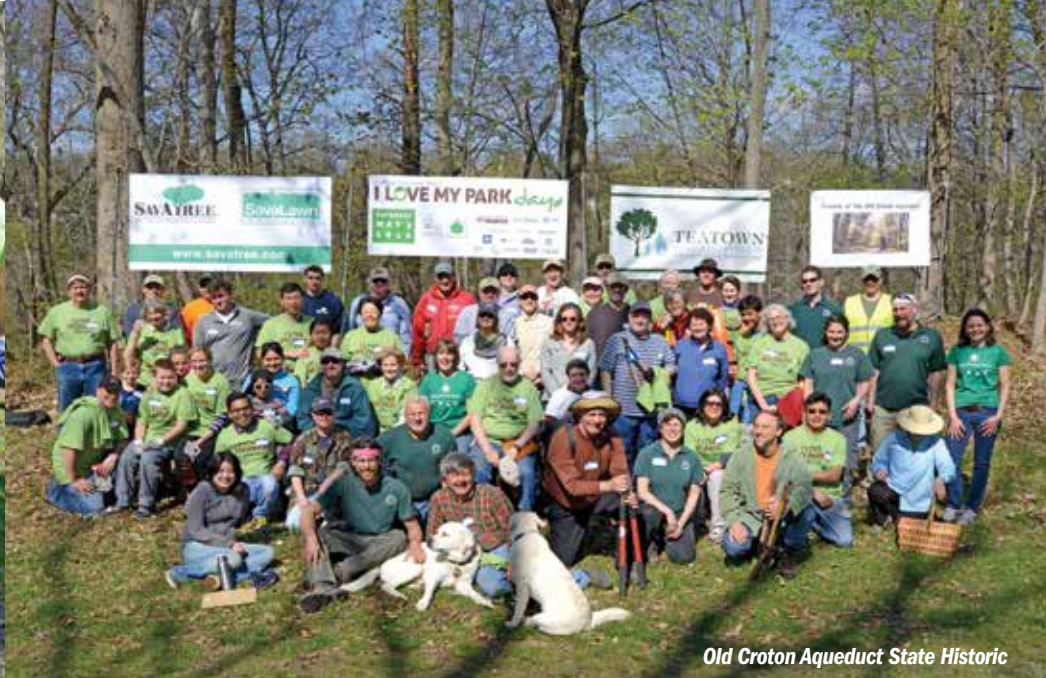
Old Croton Aqueduct State Historic