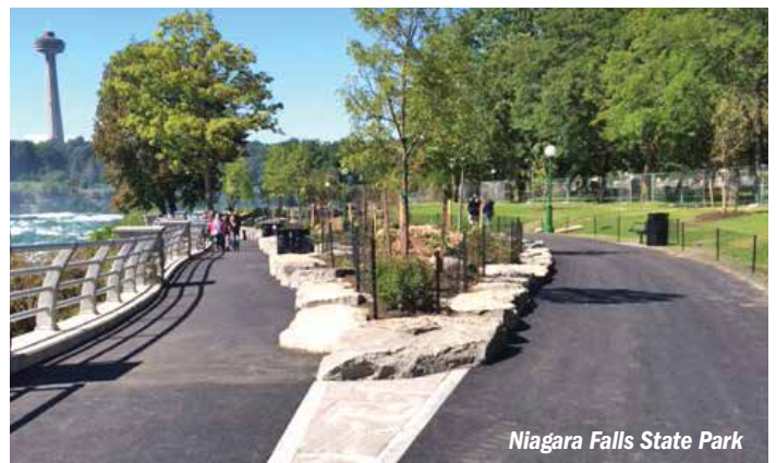
Niagara Falls State Park

In one of the largest restoration projects in New York State Park history, work at Niagara Falls State Park continued this year with projects at the popular Prospect Point and on