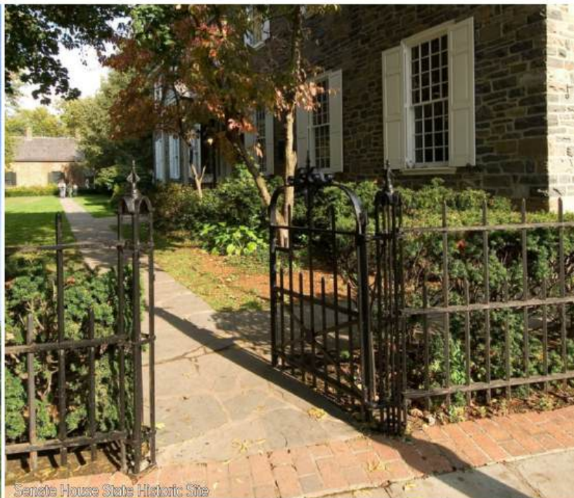
Senate House State Historic Site