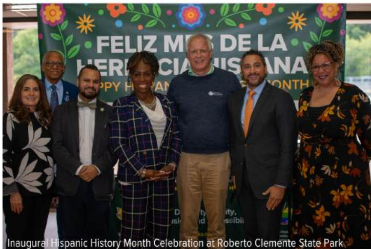
Inaugural Hispanic History Month Celebration at Roberto Clemente State Park

Throughout the year, State Parks has participated in multiple interagency efforts, including the Dr. Martin Luther King Jr. Statewide Food Drive coordinated by the Office of General Services and the campaign led by the NYS Office for the Prevention of Domestic Violence to support survivors of domestic and gender-based violence. Parks also sponsored events hosted by the Office of Diversity & Inclusion Management, including Asian American and Pacific Islander Heritage Month, Black History Month, Celebrating LGBTQIA+ Pride, and Veterans Appreciation Day.