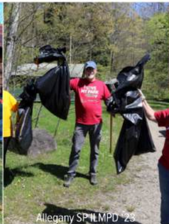
Allegany SP ILMPD '23