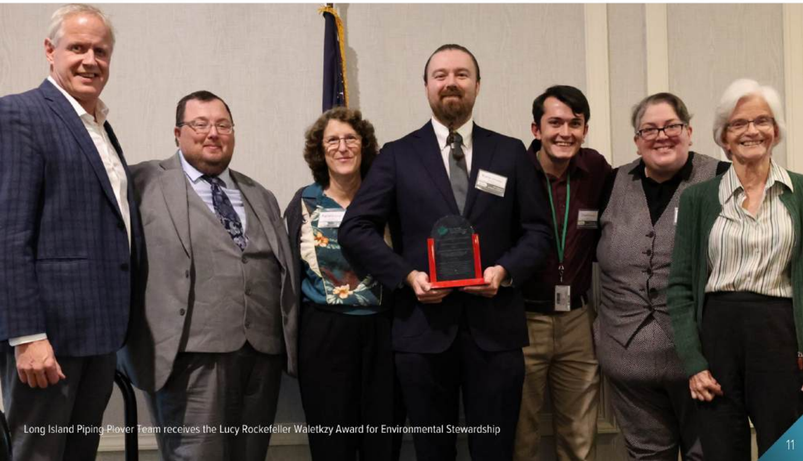
Long Island Piping Plover Team receives the Lucy Rockefeller Waletzky Award for Environmental Stewardship

Through a partnership with AmeriCorps and the Student Conservation Association, State Parks currently supports two conservation programs as part of the Empire State Conservation Corps: The Parks Corps and the Hudson Valley Corps. Together, 45 volunteers are placed in hands-on learning experiences in a variety of environmental disciplines.