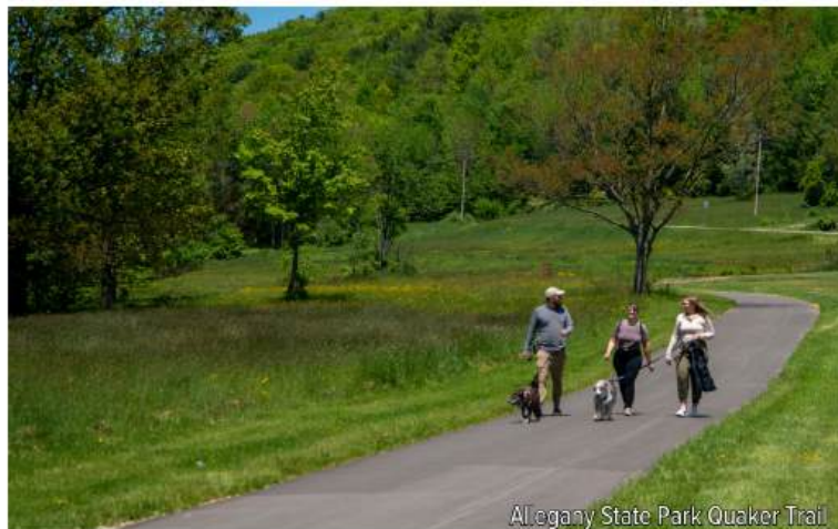
Allegany State Park Quaker Trail

A new $6.8 million multi-use trail at Allegany State Park provides an accessible alternative for bikers, hikers and campers to reach the park's popular Quaker Lake beach area. The new trail opened in time for the summer camping season at Allegany State Park, which boasts the largest campground in the state park system. The Quaker Run Area trail extension project is also supported by $2 million in State Parks capital funds as well as $1.22 million from the Ralph C. Wilson Foundation, $2.88 million from a Transportation Alternative Program grant from the Department of Transportation, and a Land and Water Conservation Fund grant.