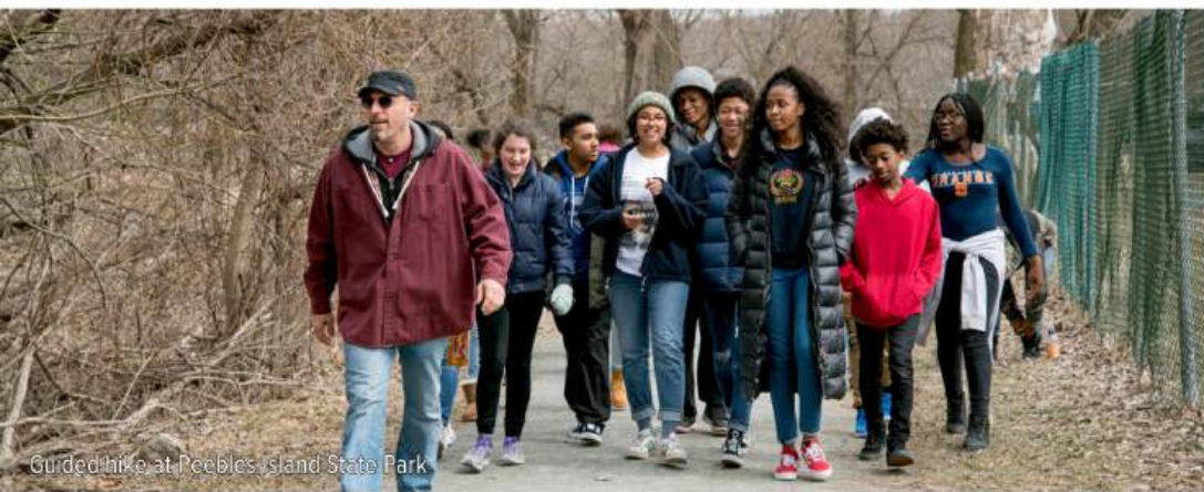
Guided hike at Pebles Island State Park

In 2023, with support from CNY Community Foundation, the Gifford Foundation, the Central Regional Commission, and the United Way of CNY Grant, funding supported the Central New York Ladders to the Outdoors program, served 1,500 youth at 15 different activities and programs including camping at the state’s first LTO camping area at Green Lakes State Park.