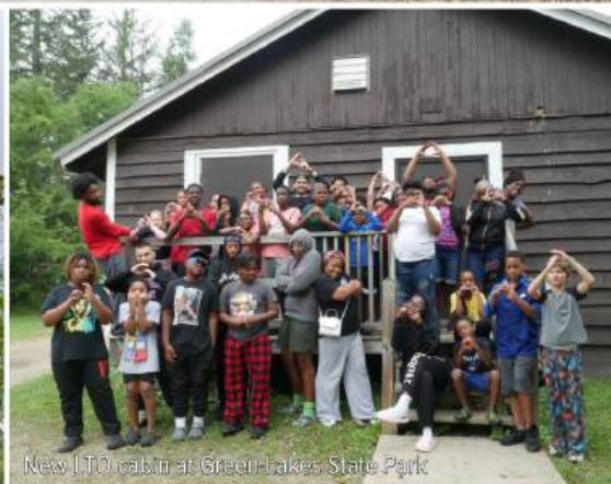
New LTO cabin at Green Lakes State Park