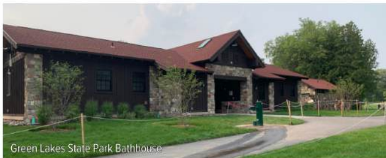
Green Lakes State Park Bathhouse

The Central region completed its first full season of the Ladders to Outdoors (LTO) program. Close to 1,300 youth from the Syracuse area participated in dozens of outdoor recreational and environmental education programs. Dozens of new community partnerships were formed to strengthen outreach. With support from community partners, the state's first group outdoor recreation and camping area dedicated to LTO opened at Green Lakes State Park. This accessible and welcoming base camp is the entry point for our youth and community groups to learn about the outdoors, experience camping and have many more adventures throughout the park. For its efforts on community engagement and youth recreation, the region received the Boys and Girls Club Champion for Children Award. The region is expanding the park's footprint by acquiring six of seven properties adjacent to Green Lakes along route 290. The seventh and final property is expected to close during the 2024. The Green Lakes State Park bathhouse received the 2023 Central New York American Public Works Association project of the year award.