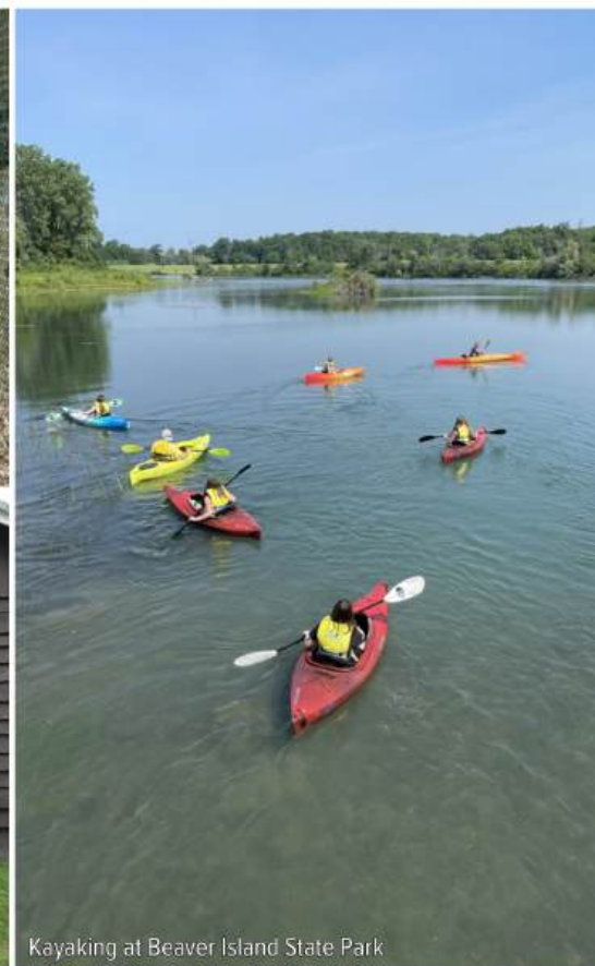
Kayaking at Beaver Island State Park