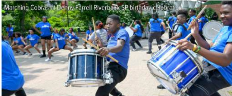
Marching Cobras at Denny Farrell Riverbank SP birthday celebration

The Long Island Commission recruited 'youth adjuncts' to attend December's meeting as part of its effort to engage with new park users and the next generation of park leaders. The Commission also supported efforts to form new friends groups at Jones Beach, Orient Beach and Wildwood State Parks. It worked with local elected officials on support for projects in Hempstead and Orient Beach State Parks. The Commission hosted fundraisers at Jones Beach (Sting, JT concerts) and Bethpage Black to support park programs, and funded an ice cream truck for end of season at LISP Regional HQ.