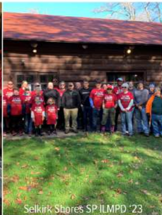
Selkirk Shores SP ILMPD '23