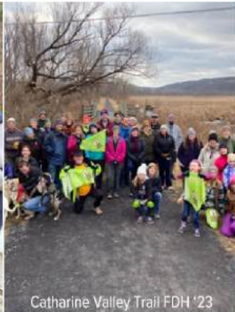
Catharine Valley Trail FDH '23