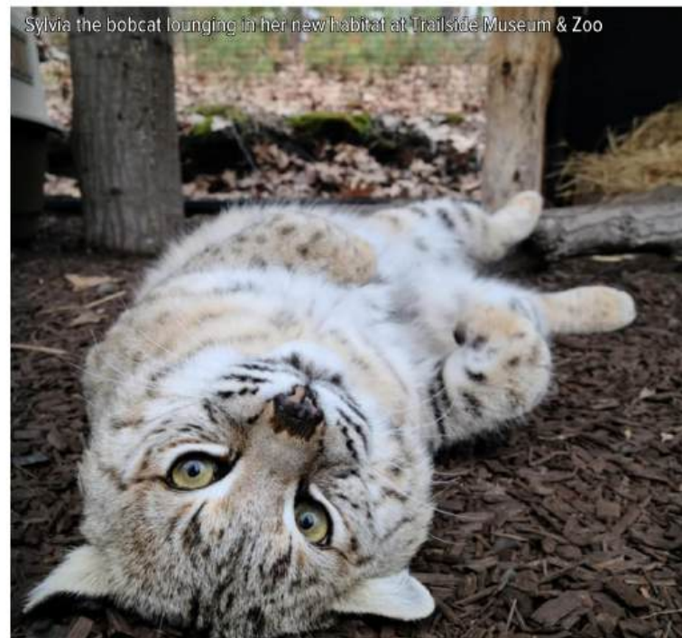
Sylvia the bobcat lounging in her new habitat at Trailside Museum & Zoo

This $1.8 million improvement project added three new, state-of-the-art animal habitats and a public loop trail — replacing a row of four smaller exhibits at the popular Trailside Zoo. To accomplish this, the previous exhibit infrastructure was first removed, allowing the area to be reclaimed. The new, larger habitats were then carefully integrated into the landscape, incorporating spectacular natural rock outcroppings. Rustic animal night houses, built from local stone and lumber to resemble the nearby museum, round out the site. Funding for the project was sourced from a $680,000 endowment, with the remainder from New York State Parks capital funds and grants. All of Trailside's featured animals are local, native species (such as black bear, eastern coyote, beaver, bald eagle, various owls and hawks, etc.) and virtually all are non-releasable and could not survive in the wild. Thus, unlike conventional zoos, Trailside functions both as an environmental education and native animal rescue facility.