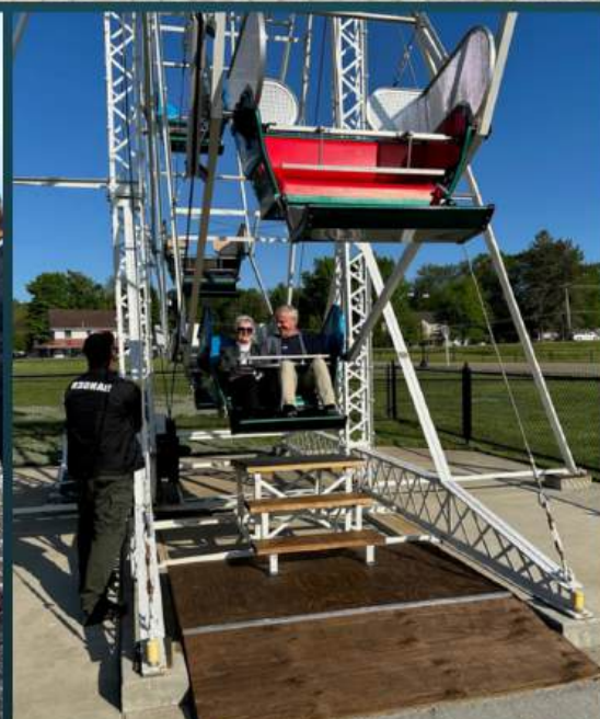
Unveiling of 1948 Ferris Wheel restoration at Midway State Park