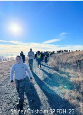
Shirley Chisholm SP FDH '23

In 2023, thousands of park visitors (two legged and four-legged) turned out across the state on January 1 to enjoy First Day Hikes and embrace nature's winter beauty. More than 80 hikes were hosted in communities across New York at state parks, historic sites, state forests, and other public lands.