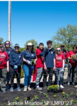
Sunken Meadow SP ILMPD '23

The twelfth annual I Love My Park Day was held Saturday, May 6, 2023 at 150 state parks, historic sites, and public lands across New York. The event, sponsored by the New York State Office of Parks, Recreation and Historic Preservation, Parks & Trails New York, and the Department of Environmental Conservation, is the largest single-day volunteer event in New York State and enhances parks, historic sites, and public lands, and raises awareness of the state's outdoor recreation assets and their needs.