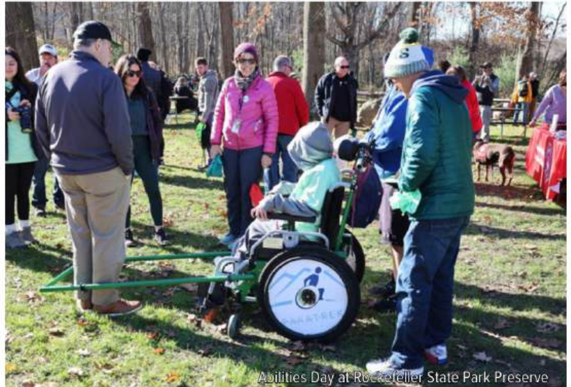
Abilities Day at Rockefeller State Park Preserve

Parks hosted the inaugural Hispanic Heritage Month celebration at Roberto Clemente State Park to honor the workforce's rich Hispanic/Latino culture and history. Spanish-speaking staff were invited to participate in a recording session for the Spanish Centennial promotional video as part of the goal to increase the inclusivity of Park resources.