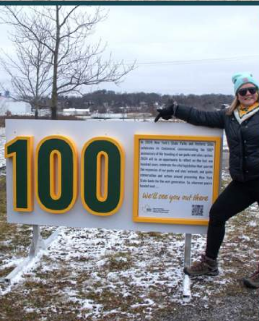
First Day Hike at Genesee Valley Greenway State Park