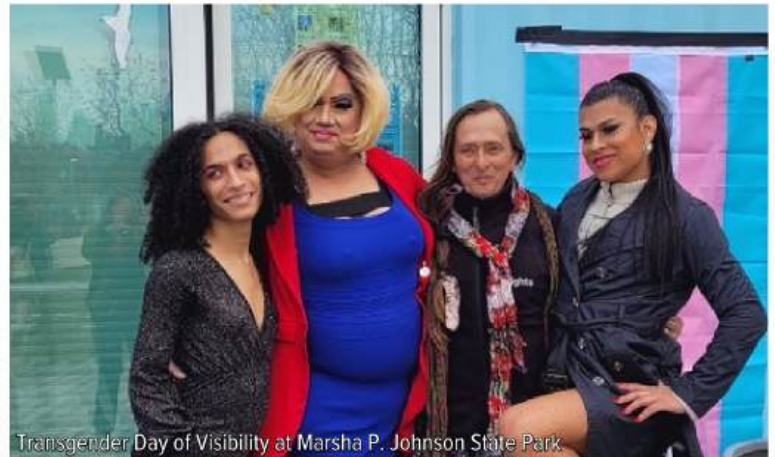
Transgender Day of Visibility at Marsha P. Johnson State Park

The ornamental gateway at Marsha P. Johnson State Park was unveiled with a ribbon cutting to greet visitors with Marsha P.’s enduring spirit. Communities came together for Drag Story Hours, Transgender Day of Visibility, and for Transgender Day of Remembrance, a solemn reminder of the disproportionate violence experienced by transgender and gender non-conforming individuals. Across the state, from Gloversville to Niagara Falls, agency employees attended LGBTQIA+ pride events and supported the delivery of the Pride Month proclamation.