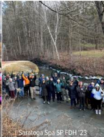
Saratoga Spa SP FDH '23