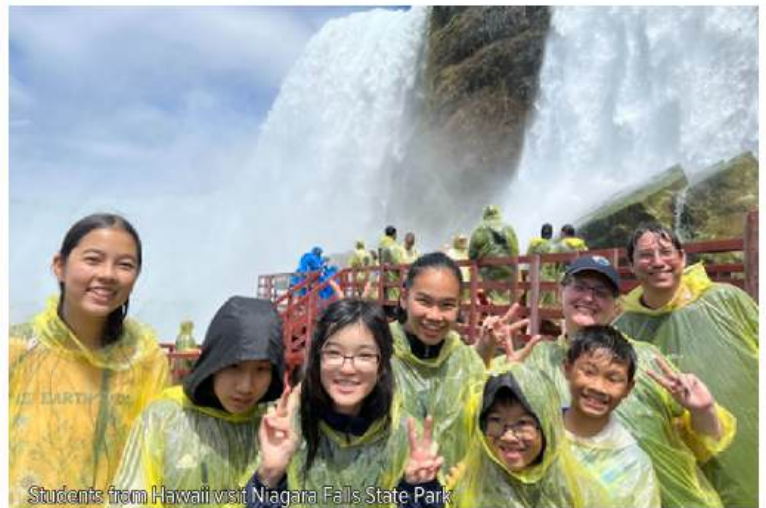
Students from Hawaii visit Niagara Falls State Park