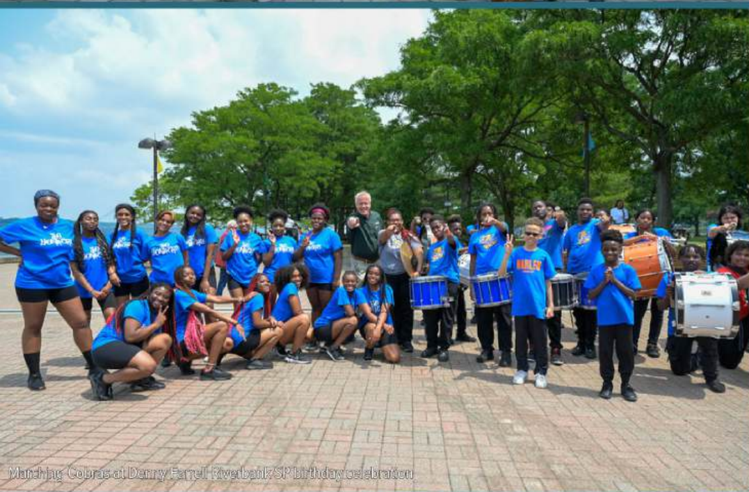
Marching Cobras at Denny Farrell Riverbank SP birthday celebration