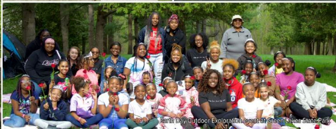
Earth Day Outdoor Exploration event at Green Lakes State Park