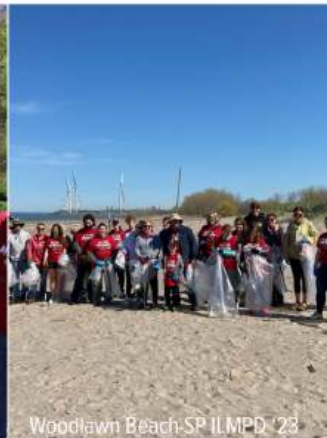
Woodlawn Beach SP ILMPD '23