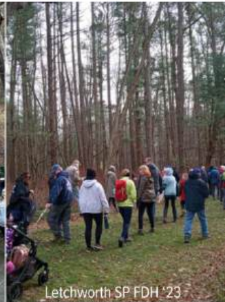
Letchworth SP FDH '23