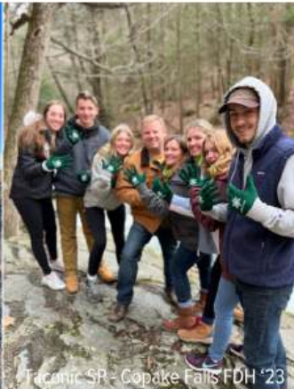
Tacoma SP - Copake Falls FDH '23