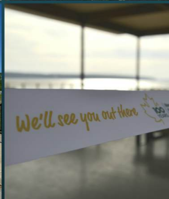
Sojourner Truth State Park Ribbon Cutting