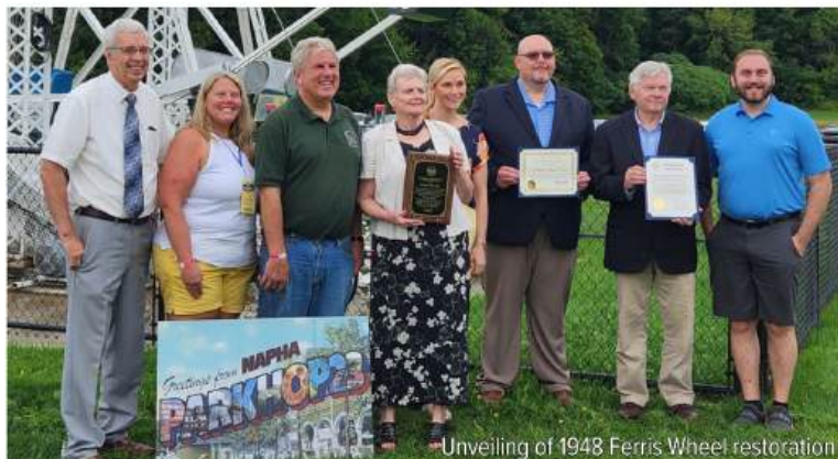
Unveiling of 1948 Ferris Wheel restoration

The Commission continues to support the effort to restore the Barcelona Lighthouse. Design plans were completed in 2023 to renovate the Barcelona Lighthouse tower, which will go to construction in 2024.