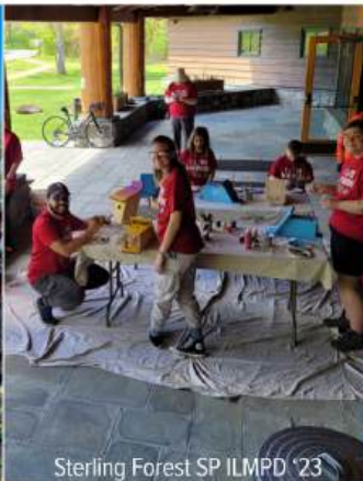
Sterling Forest SP ILMPD '23