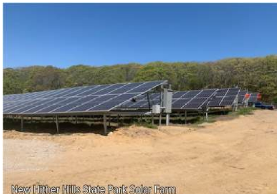
New Hither Hills State Park Solar Farm