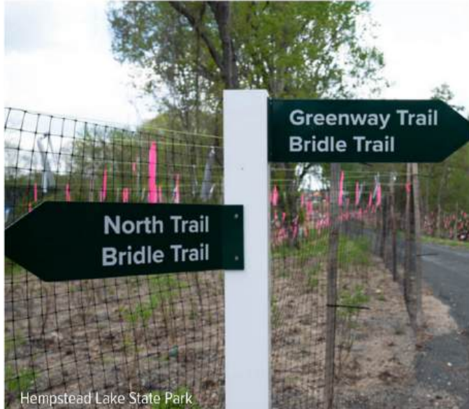
Hempstead Lake State Park