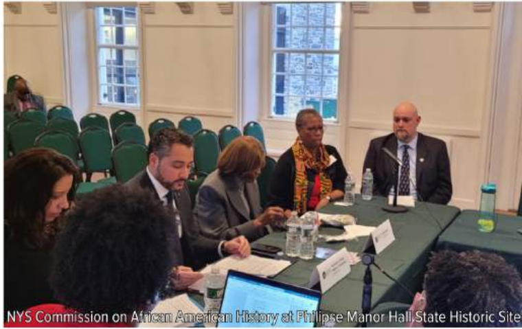
NYS Commission on African American History at Philipse Manor Hall State Historic Site

showcase the immense knowledge that historic site staff have. Philipse Manor Hall Historic Site won an Award for Excellence from the Greater Hudson Heritage Network to recognize the reinterpretation and renovation that fully incorporates “Our Whole History” stories of the Indigenous people from whom the Philipse lands derive, enslaved Africans from whose work and trade the Philipse family prospered during the pre-Revolutionary era, and the family’s various journeys.