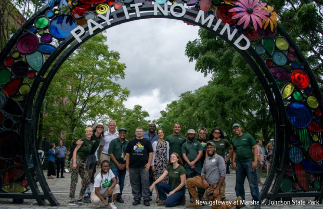
New gateway at Marsha P. Johnson State Park