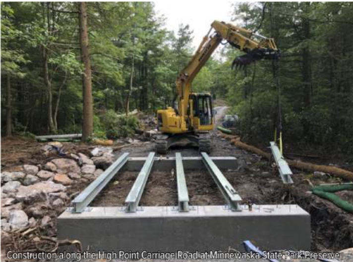
Construction along the High Point Carriage Road at Minnewaska State Park Preserve

In 2023, OSI’s collaborations with State Parks led to innovations and improvements across a broad range of parks and geographies. In Orange County, OSI worked with State Parks and the United States Military Academy at West Point to design and build a creative new trail bridge at Schunnemunk State Park—the sixth consecutive year that cadet engineering students constructed a trail bridge within a state park. And at Fahnestock State Park, OSI continued efforts to enhance the park with construction of a 65-foot pedestrian bridge and streambank stabilization along the Hubbard Perkins Loop Trail.