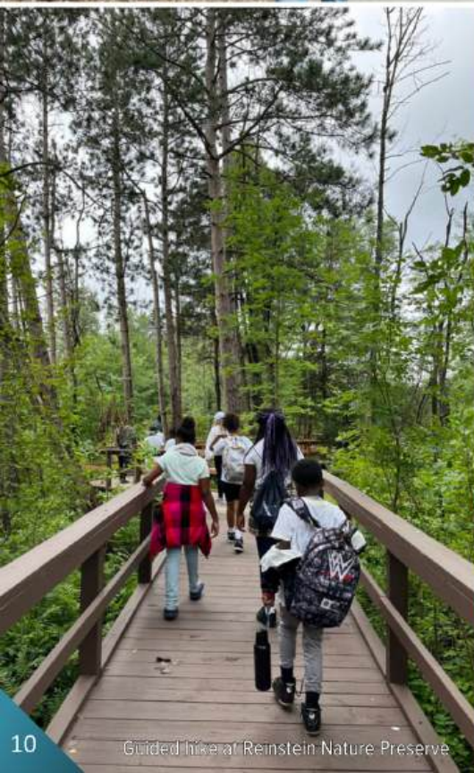
Guided hike at Reinstein Nature Preserve