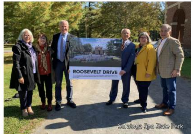
Saratoga Spa State Park

The $4.2 million redevelopment of Roosevelt Drive within Saratoga Spa State Park improves transportation safety within the park by adding pedestrian and bicycling pathways adjacent to the park's busiest stretch of roadway, which connects the Avenue of the Pines with the golf course, pools, picnic areas, and the Roosevelt Baths and Spa. A new Welcome Terrace, referred to as The Arcade, sits at the entrance of the Saratoga Spa State Park's neo-classical Roosevelt Campus. It will feature a circle of benches to create the perfect spot for park visitors to socialize, relax, and take in their surroundings. For a limited time, people can adopt and dedicate one of these benches.