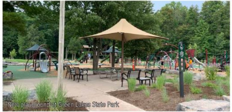
New playground at Green Lakes State Park

Three million dollars in improvements at Green Lakes State Park in Onondaga County were completed this summer. A new cabin camping area, a nearby playground and four-season bathhouse were designed to host groups through its Ladders to the Outdoors program that works to increase youth's access to outdoor recreational spaces, equipment, transportation, and skills development in underserved communities.