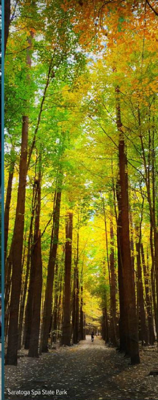
Saratoga Spa State Park