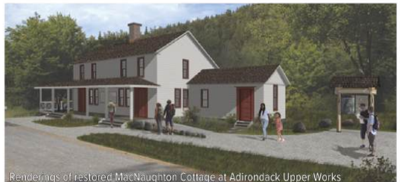
Renderings of restored MacNaughton Cottage at Adirondack Upper Works

In the Adirondacks, efforts to enhance and promote a southern entrance to the popular Adirondack High Peaks continued as work began to restore the historic MacNaughton Cottage at OSI’s Adirondack Upper Works property in Newcomb. The larger project is aimed at better dispersing visitors throughout one of the most popular areas of the Adirondacks. OSI also initiated the design of a new trailhead and parking area at the eastern end of the Adirondack Rail Trail in the Village of Lake Placid, funded in part by an OSI-secured $500,000 EPF grant.