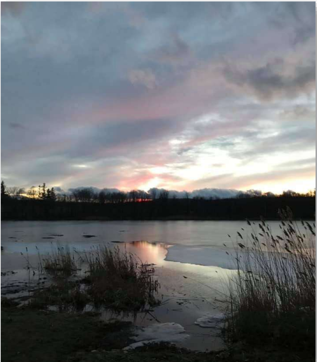
Photo of Rudd Pond

Wednesday March 6 th - Snowshoe Hike at 1 p.m. (conditions permitting). Free 3-mile snowshoe hike; route to be determined based on conditions. We will meet at the park office: 253 State Route 344, Copake Falls, NY 12517. We have a limited number of snowshoes, so please bring your own if you have them. Snowshoeing is fun and it's a great workout, so don't be afraid to come with us even if you are a first timer. Wear sturdy boots and watch this video by our friends at the NYS Department of Environmental Conservation to learn more about staying safe while having fun outdoors in the winter: https://www.youtube.com/watch?v=Epr0PyTgQQE&feature=youtu.be