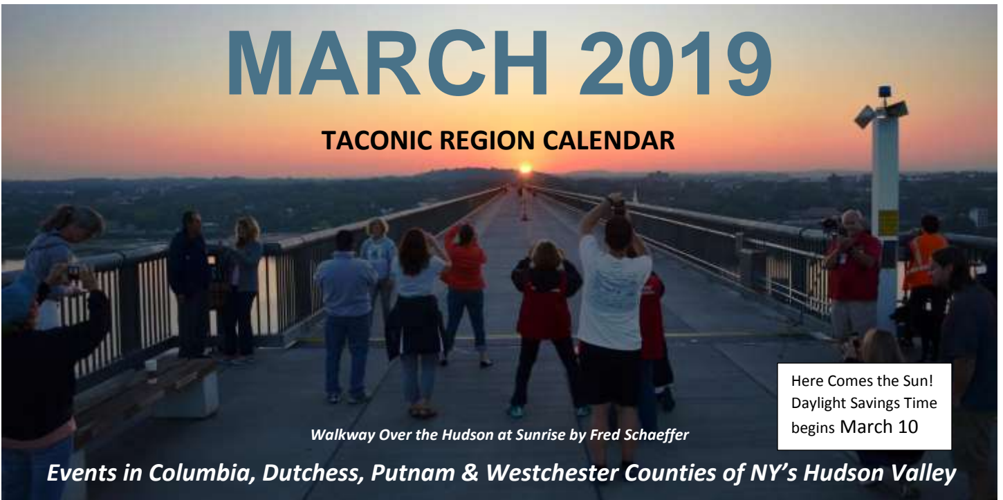
Walkway Over the Hudson at Sunrise

Here Comes the Sun! Daylight Savings Time begins March 10